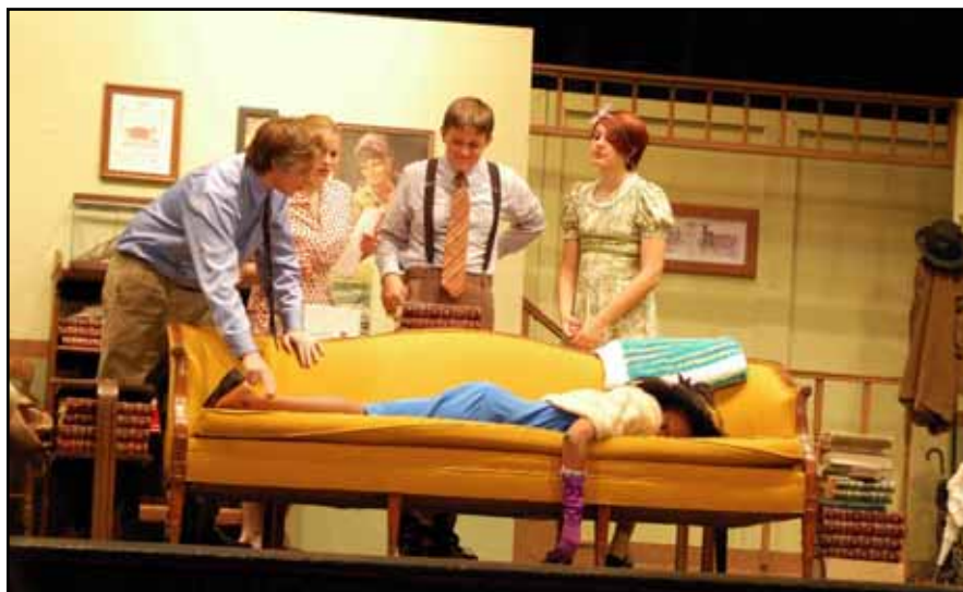
Cast of "You Can't Take it With You"