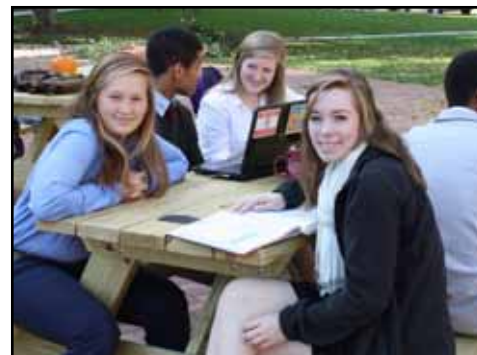
Students enjoying the picnic table, a gift from the Class of 2012.