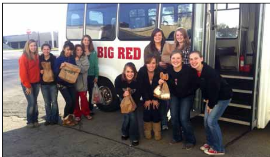
The Wayland Girls Varsity Volleyball Team spent some time this fall helping out the Beaver Dam Food Bank..